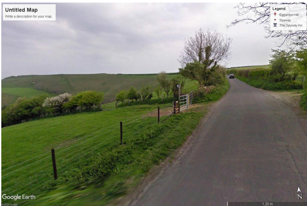
Single access point to the fields & Slope. Gate at:- Lat N 50.74311 Long W 2.64706 (OS SY544939) This is the road that comes up from the Spyway Inn.