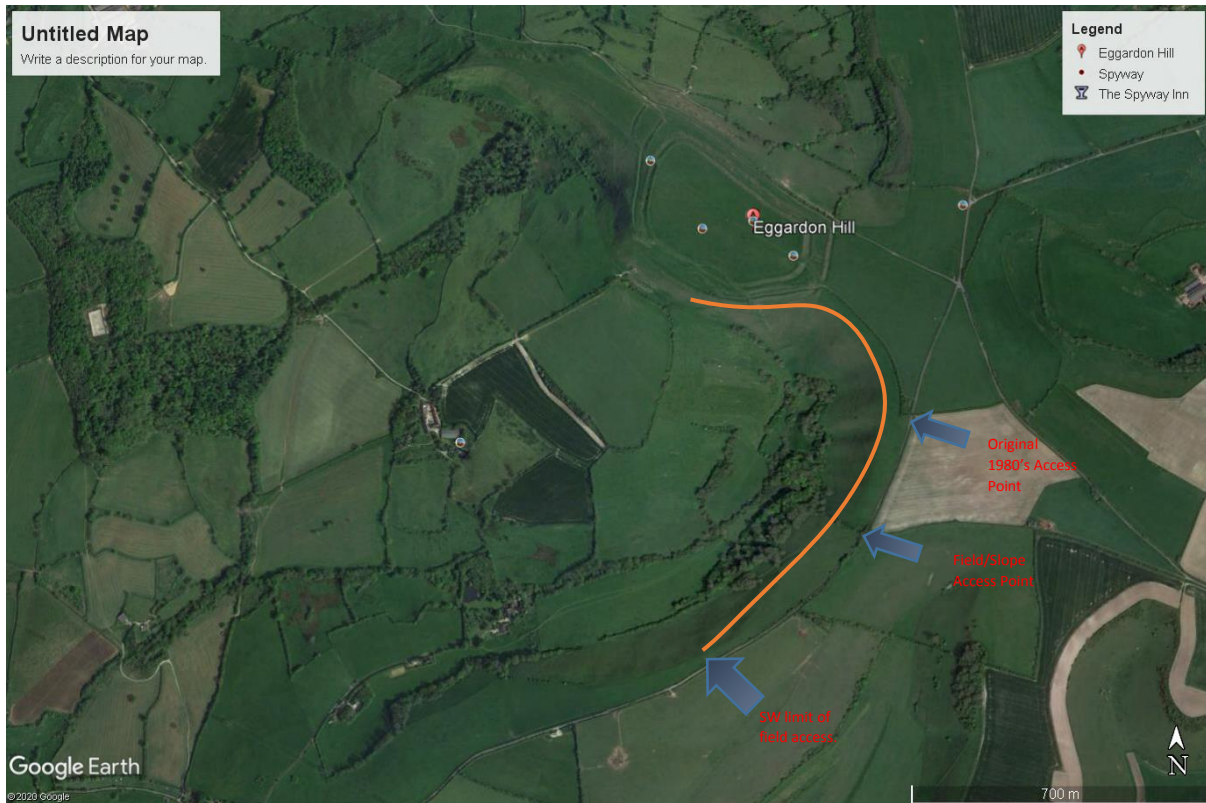
Google's Earth satellite picture of the bowl. Orange line indicates approx extent of ridge line of the slope available in the fields afforded by the new access.