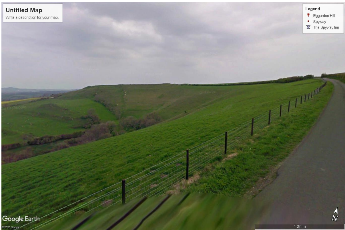
View looking N towards the Hillfort alongside the west facing slope.